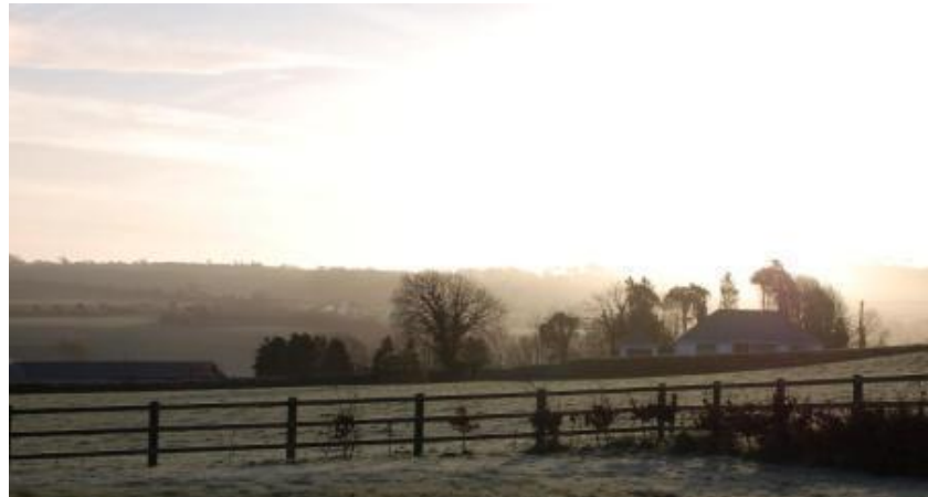
Views from the V B course...

UKIFAC will be a great event for this new club. 150 archers from Ireland, England, Scotland and Wales in the Bowmens woods will be an experience to savour. This will be the third time that UKIFAC will take place in Ireland following Loughcrew in 2007 and Dunbrody in 2011. It will be a busy period of preparation for the club but will inevitably bring out the best from their band of archers. And just how many members will they have by then?