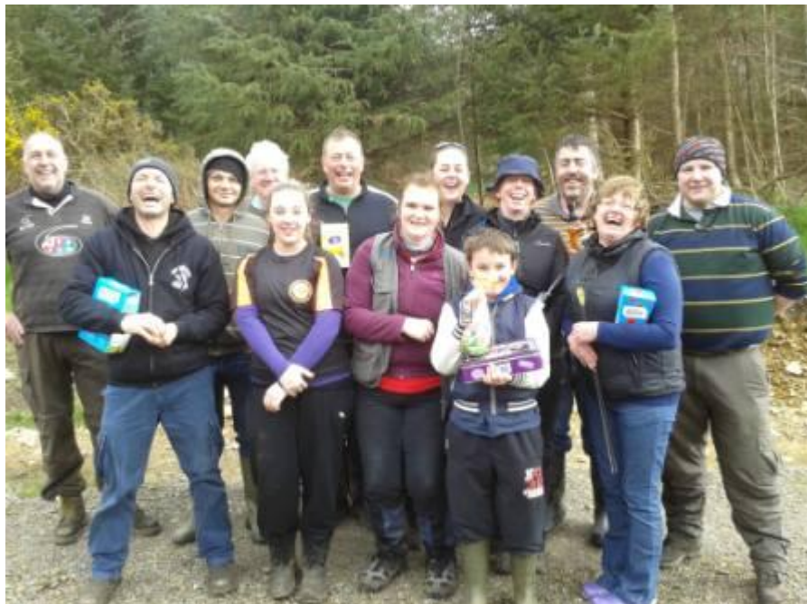
Enjoying the April shoot at Valley Bowmen woods.