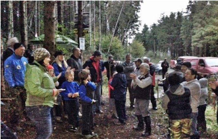
The V B shoot held at Warbow last November...

They now have many Facebook likes. As IFAF expands so will Valley Bowmen no doubt. Anybody interested in joining this club check out their Facebook page or the IFAF website.