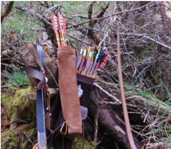
The Valley Bowmen course