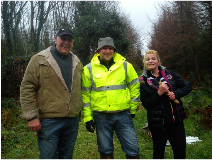
Hard at work setting out their course in January